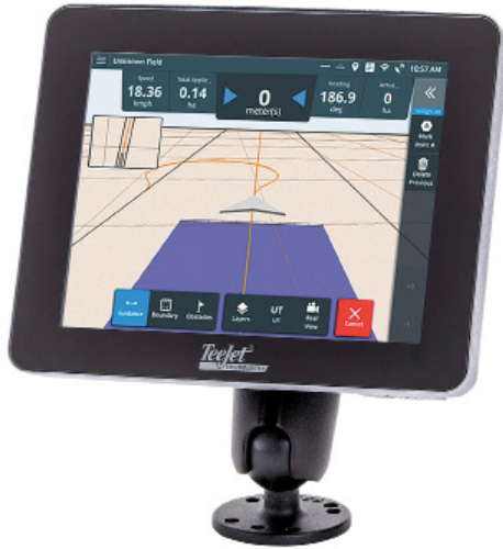
MATRIX 908 CONSOLE

The Matrix® 908 is a full-featured guidance and rate control system in one. This flexible platform can be adapted to a wide range of machines and application requirements to best suit your individual needs.